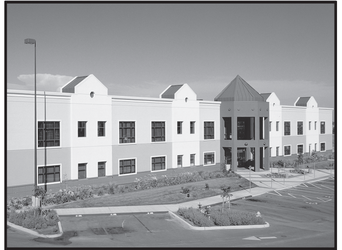
This is the Medical Office Building (MOB).

Go to the Medical Office Building (MOB) located north-east of the Hospital. It is on your left as you drive in.