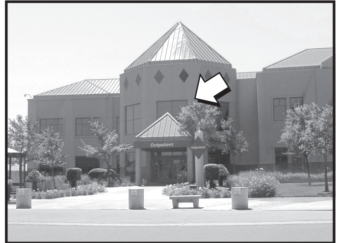
This is the Outpatient entrance.