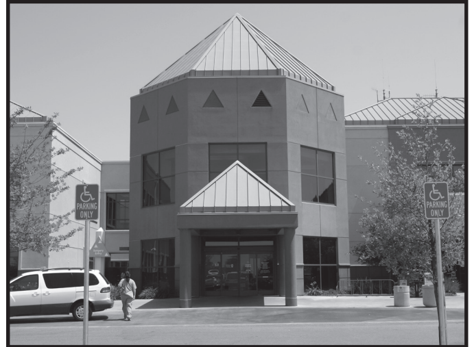
This is the Imaging entrance.

Go to the Imaging entrance from the parking lot.