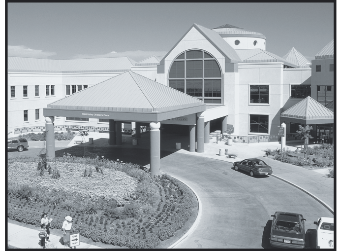
This is the Main entrance.

Go to the Main entrance from the parking lot.