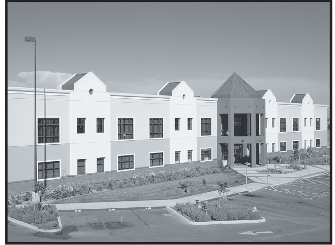
This is the Medical Office Building (MOB).

Go to the Medical Office Building (MOB) located north-east of the Hospital. It is on your left as you drive in.